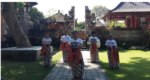
Picture 3. The process of recording The students can explain the basic Javanese dance movements in English

Learning a form of dance, especially classical dance, is actually about a few things that cannot be ignored. This includes several aspects regarding the problem of talent, interest, perseverance, and sincerity. All these aspects are interrelated and very necessary in order to be able to easily master the dance. Given that the technical difficulty of classical Javanese dance is quite high, it is necessary to write clearly about Javanese dance techniques. It is possible to expedite and make it easier for students to learn the techniques of the Javanese dance.