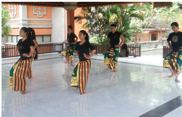
Picture 1. The process of recording.

use of the property, the use of costume and the use of movement which is called mudra . The movements are not merely used, but they are designed and processed in order to produce more beautiful movement. For example, walking in a dance is taken from the movement of everyday life. The dance is done by lowering the body ( aed or ngaed ) followed by head movement called ngontel will result in a graceful movement. The other movements are mebeh and ngelo which are taken from tree movement blown by the wind known as sayar-soyor movement. These movements are done by twisting the body to the right and to the left followed by the movement of the chin towards the right and the left in order to enhance the beauty of the movements. All movements which are taken from everyday life and also from the nature with the use of the costume that is beautifully designed can produce beautiful movements.