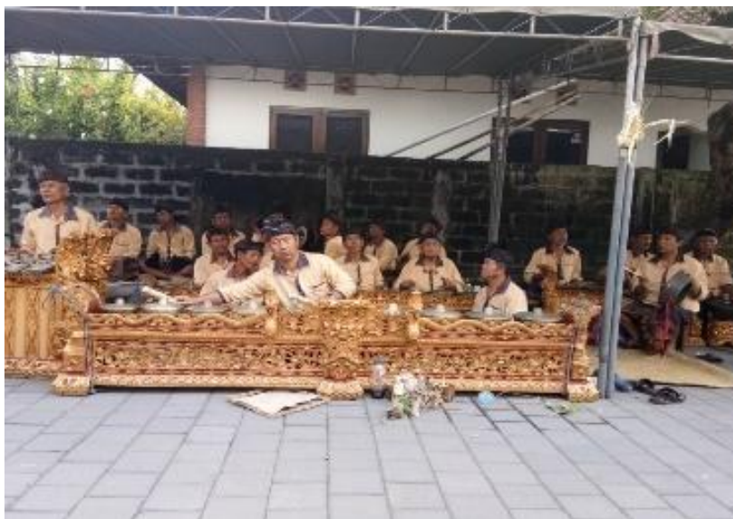
Figure 1. Gong Kebyar is accompanying the Pendet Memendak Dance at Saren Gong Temple Kerambitan

Moreover, Pendet Memendak dance creates a straight floor pattern with 3 lines, followed by forming a circular floor pattern, surrounding area jeroan (main yard) of Saren Gong temple three times in a clockwise direction. Pendet Memendak dancers dance around the banten or sasaji offered at Saren Gong temple. The offerings are placed on a long table in front of pelinggih utama in jeroan pura (main yard) of the temple. Pendet Memendak dancers who danced freely/improvised seemed to dance using delicate princess make up and fashion dance to the temple. It can be seen from the colors, lines and ways of wearing the clothing. Her make up looks very simply which can be seen from the use of brown / natural eyeshadow that is not too flashy (white, light brown and dark brown), blush on, brown eyebrow pencil, eye liner and lipstick. Likewise, on the headdress of the Pendet Memendak dancers that look very simple by using a Balinese bun which is pinned by a clover flower, one golden flower, and one red rose as shown in the picture below.