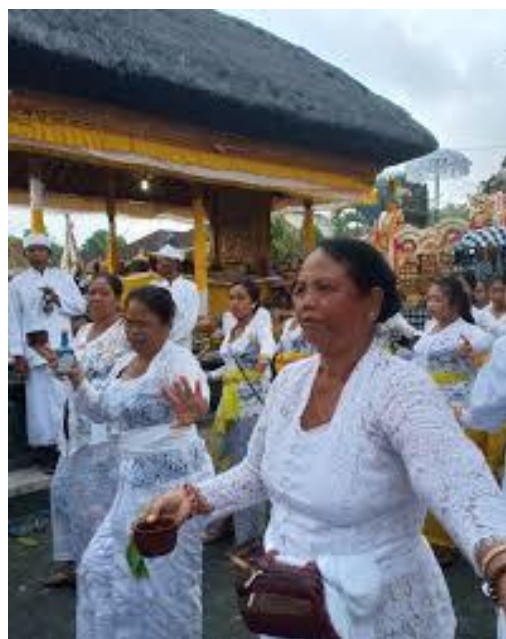
Figure 2. Pendet Memendak Dance at Saren Gong Temple, Kerambitan Village Tabanan

The sacred and profane nature still influences the Kerambitan Village people. It appears in the direction orientation kaja (north) and kelod (south), belief in the existence of Lord Shiva's power (siwaloka) in the universe, belief in a region that is more front, more sacred (luwanan) and rear area, not holy (tebenan) and the attitude of respecting the mountains and the sea as a powerful part of the earth provides a strong foundation for offering Pendet Memendak dance. Bandem (1996:33) says that the dance presentation is placed in a special axis area of Tri Mandala, a division of the temple area : (1) division of upper space or utama, where the dance of wali performed, (2) division of middle-level space or madya, where the dance of bebali