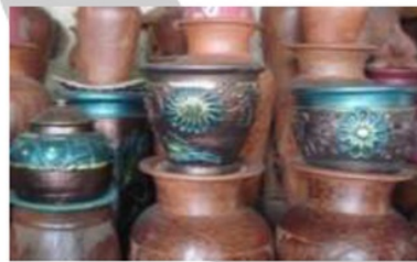
Figure 10. Yogyakarta earthenware flower pot and Lombok pitcher

The observations were conducted towards an ornamental earthenware in Desa Kapal. It can be said that non-Balinese ornamental earthenware has a function well, offering shapes in more diverse and varied than Balinese ornamental earthenware. non-Balinese ornamental earthenware has a good shape, caratan (jug), jar, ashtray, fuel poison mosquitoes place, flower pot, natural flower pot, seating trash in cylindrical shaped, the garden lamp shade, wall hanging, jewelry boxes, piggy bank and so on. Non-Balinese ornamental earthenware is dominated by the earthenware from Lombok, next to Kasongan Yogyakarta products, the ornamental of Desa Mayong Jepara and any ornamental from other areas in Java. Here are some examples of Non-Balinese ornamental earthenware.