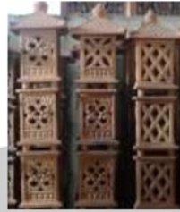
Figure 8. The garden lights box-shaped