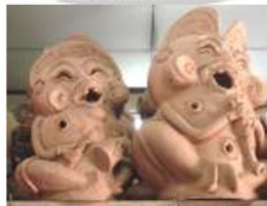
Figure 2. nabuh statues