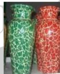
Figure 11. Lombok earthenware pitcher decorated unlike egg shell

The both pottery visualization above can be explained that non-Bali ornamental earthenware shows more shape, diverse, and varied than Balinese ornamental earthenware as well as its quantity is more. Thus, non-Bali ornamental earthenware offers more choice to consumers. Likewise, it is viewed of the beautiful shapes are displayed, it looks better than Balinese. The decor is an element that serves as an ornamental decoration to beautify an object appearance. The elements appear are not a limited trimmer, ranging from simple to complex, depending on the creativity and sense of aesthetic sensitivity artisan (Budianto in Jayanthi, 2015: 81). At craft products including pottery, after the decoration process usually, there is a forwarding process or final process called finishing . Finishing is the final process before a product is marketed, its type is very diverse.