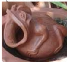
Figure 1. frog statue

Subsequently, it was found nabuh (playing Balinese music instrument) statue design from Desa Pejaten produce four variations, i.e. a statue that playing Balinese traditional musical instruments such as kendang , cengceng , suling , and gangs . The pig motif statue found at a shape upon two variations functioned as a celengan /piggy bank (the place for saving money). The other Balinese ornamental earthenware statue is found for one design in one variation such as a mask and Brahma statue. In one hand, the variation based on the shape, and on the other hand, its variation based on the size, from small to large categorized. Here are some samples of Balinese ornamental earthenware statues.