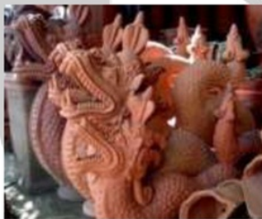
Figure 4. dragon statue

The non-Bali ornamental earthenware types that are marketed in Desa Kapal Badung located in Desa Kasongan Bantul Yogyakarta, next from Desa Mayong, Jepara regency, Central Java. The visual shapes included a dragon statue, goat statue, horse statue, elephant statue, lion statue, chicken statue, human statue (male and female primitive), kids standing statue, half body Buddha statue, a child Buddhist statue and Buddha head statue. Non-Balinese creation was found more than 15 shapes or designs, each shape consisting of 1 to 2 variations, a Buddha statue found in 5 shapes, human statues in 5 forms, the others each consisting of one form. Here are some examples of non-Bali ornamental earthenware statue design.