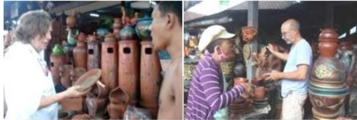
Figure 12 and 13. Foreign tourists are bargaining in an ornamental earthenware Desa Kapal, Badung Regency, Bali Island.

quantity is very less compared to the non-Balinese product. The observation that is conducted during the study period, also found the buyers tend to choose non-Bali ornamental earthenware products included the foreign consumers of traveling as shown in the following figure: