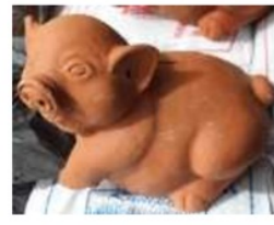
Figure 3. pig statue