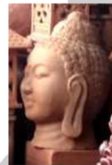
Figure 6. Buddha statue

The statue design types of Kasongan can be seen in a shapes varieties and the look ranges from plain or non-finishing, paint coated dye, affixed to other materials or modified. The performance is more varied and in greater numbers make the products of non-Balinese earthenware statue marketed in Desa Kapal, increasingly, conquering the marketing spaces, and sinking attendance Balinese ornamental earthenware statue. Referring to the Barthes approach (Zoest, 1993: 4), statue various is seen as a signifier that has denotative meaning i.e. as decorative objects consisting types of different statue, function, and decoration. The other denotative meaning is non-Balinese products shape looks more diverse and varied than Balinese. Whereas the connotative meanings that can be perceived non-Bali are more creative than Balinese artisan, due to the visual design shape and its quantity is more happening in the market. Many quantities are more preferred by consumers (Oentoro, 2010: 7).