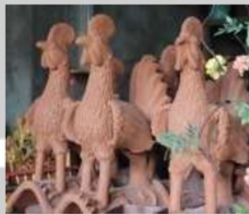
Figure 5. chicken statue