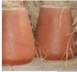
Figure 7. Jeding (barrel)

attached lights each consist of one shape and one variety. Then, caratan (a place for drinking water) shape consists of one shape and one variation, as well as, a satay grilling place on one form and one variety. Here are some examples of Balinese ornamental earthenware with its function: