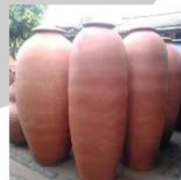
Figure 6. The products of combustion.

Pottery products that require coloring painting process is carried out using tin paint dye from solution. After making burnt to produce the brown colors, green, glossy black, some are flat and there is also