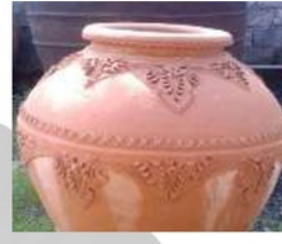
Figure 9. Ornament details