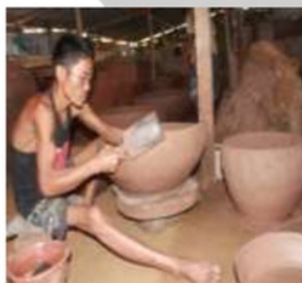
Figure 4. The forming process