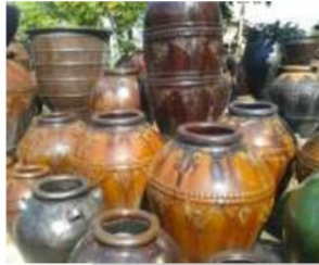
Figure 7. Various color applications

e.g. is capable of displaying color shades of dull or shiny with a color variety e.g. black, melted chocolate, green, and so on (Figure 7 and 8). The colors are very hard glaze pottery products found in other types of large size, except the pottery products of Serang Banten. Therefore this kind is named a unique pottery of Serang Banten, because of the shape and coloring characteristic capable of displaying a solid impression and strong. The pottery uniqueness makes it is loved by foreigners and the societies in Bali. The societies who enjoyed the pottery products are locals from Bali and outside.