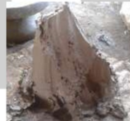
Figure 3. A soil processed ready formed