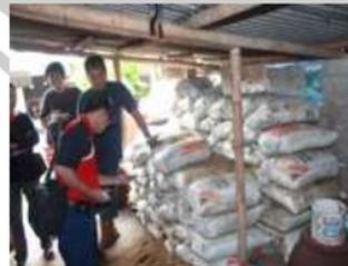
Figure 2. Fine sand as mixer material ingredients