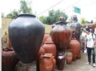
Figure 8. The measure comparing the pottery vs human