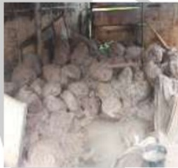
Figure 1. Raw material of clay

However, in Bali the milling process is not done, due to the owners do not have a milling machine. The next process is establishment the pottery body according to the desired design (Figure. 4). The formation result then is dried in the sun for one to two days depending on the size and the body thickness upon a pottery and weather. After the pottery bodies really dry, followed by the combustion process. All items that are ready to be burned fed into the furnace (figure. 5) and neatly arranged. The burning process was begun by entering a firewood to the furnace head and lit with fire. The burning process takes about 10 to 12 hours, in order to the results that were obtained a mature, robust, and waterproof (figure. 6).