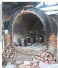
Figure 5. Furnace