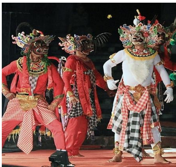
Figure 2: Innovative Wayang Wong

imitation) should pay attention to cultures (23). creation of integrated and innovative tourism regions, positively influencing competitiveness (24).