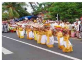
Figure 3 Rejang Renteng Dance