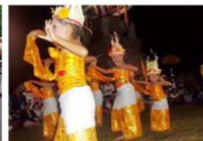
Figure 4. Dancers surround pelinggih

Second, after turning around for three time, the dancers are in front of pelinggih of Manik Ceraki Dance to natab banten pajegan led by Jero Mangku of Dalem Temple. Jero Mangku