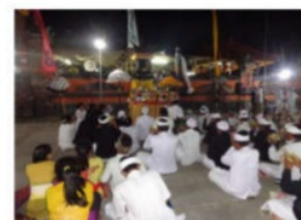
Figure 2 Dancer Sanctification in Dalem Temple

After praying together is done, then Rejang Renteng Dance is shown with the performance structures as follows.