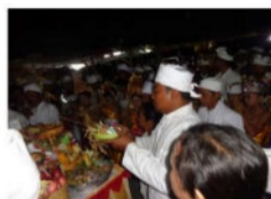
Figure 1 Stakeholder leads the ceremony Courtesy of Ruastiti, 2014.