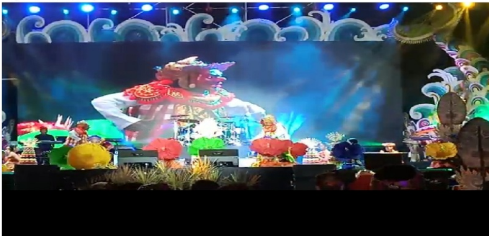
Figure 1. Wayang Wong Millennial (Doc. Ruastiti, 2019)

Positive responses include tourists given because of the phenomenon of attractive tourism (Pradana, 2019). From various moment Wayang Wong Millennial performances, it is known that various groups of spectators, including the general public, academics, journalists, and tour operators, positively welcomed the existence of the Wayang Wong Millennial performance art. It indicates that Wayang Wong Millennial deserves to be used as new performance art for Bali tourism activities. The art of Wayang Wong Millennial can be developed as part of a prestigious tourist attraction and is able to attract the attention of tourists who are present on the island of Bali. This is in line with the results of Ruastiti's (2010); Pradana and Pratiwi (2020) prove that the Balinese people have a variety of commodities and tourist attractions developed from Balinese culture, especially Balinese traditional arts. The development of performing arts, including Wayang Wong performance