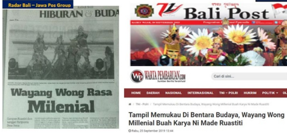
Figure 2. Head Line Mass Media about Wayang Wong Millennial (Doc. Ruastiti, 2019)

Figure 2 shows the news of Wayang Wong Millennial in some print and online mass media. Generally, the mass media coverage reviews that this Wayang Wong Millennial packaging product is an effort to save local genius Indonesian people that needs to be supported by all parties including support from arts, universities and support from the government. The coverage also reflects that the Balinese people and journalists seem to be very supportive that the Wayang Wong Millennial deserves to be staged as a new tourist attraction.