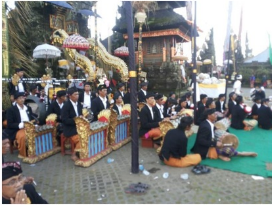
Foto 3. Gamelan Babonangan in Batur village 2016.