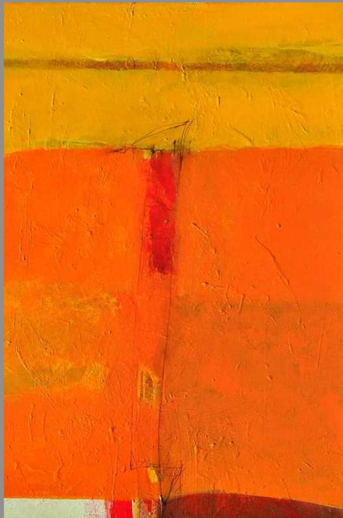
Yellow Space Border | Garis Batas Ruang Kuning. 100 x 80 cm, acrylic on canvas, 2011

Kepekaannya pada bentuk-bentuk organik membawanya untuk terus mengumandangkan isu-isu lingkungan pada setiap karyanya. Namun Wayan dalam hal ini telah melangkah lebih jauh, karena ia mampu menciptakan kembali dengan bebas realitas realisme alam luar (persepsi biasa apa yang dilihat) menjadi dunia dalam (bahasa pribadi) dengan spirit personal yang dimiliki. Dengan demikian maka muncul ralitas yang lebih segar dan hidup sebagai suatu daya pencapaian yang dasyat. Ekspresi lukisannya tidak bermaksud membuat lukisan abstrak. Lukisan-likisan Wayan tidak sesungguhnya bisa dikatakan lukisan abstrak-non abstrak. Lukisannya juga tidak memperlihatkan gejala ingin menetralkan citra seperti kebanyakan lukisan abstrak. Ekspresi lukisannya seperti penjelajahan mistik yang berinteraksi dengan dunia luar namun diolah sesuai apa yang ada dalam dirinya. Sehingga apa yang dihasilkan tidak bisa diamati dengan teori-teori abstrakisme dan ekspresionisme. Absak yang berisi makna, hal ini terlihat pada penggunaan garis, warna, sapuan kuas dan ikon-ikon tertentu untuk membangun dunia simbol. Syarat mutlak untuk masuk pemikiran fenomenologi tentang alam inderia ialah menghapus asumsi naif tentang benda sebagai benda. Kata Bakker supaya masuk ke dalam gejala misterius dari pengamatan (alam indera) kita harus menghapuskan setiap pemikiran tentang hal mengada yang berdiri sendiri. Manusia menstransformasikan alam menjadi alam bagi manusia yaitu alam pemaknaan.