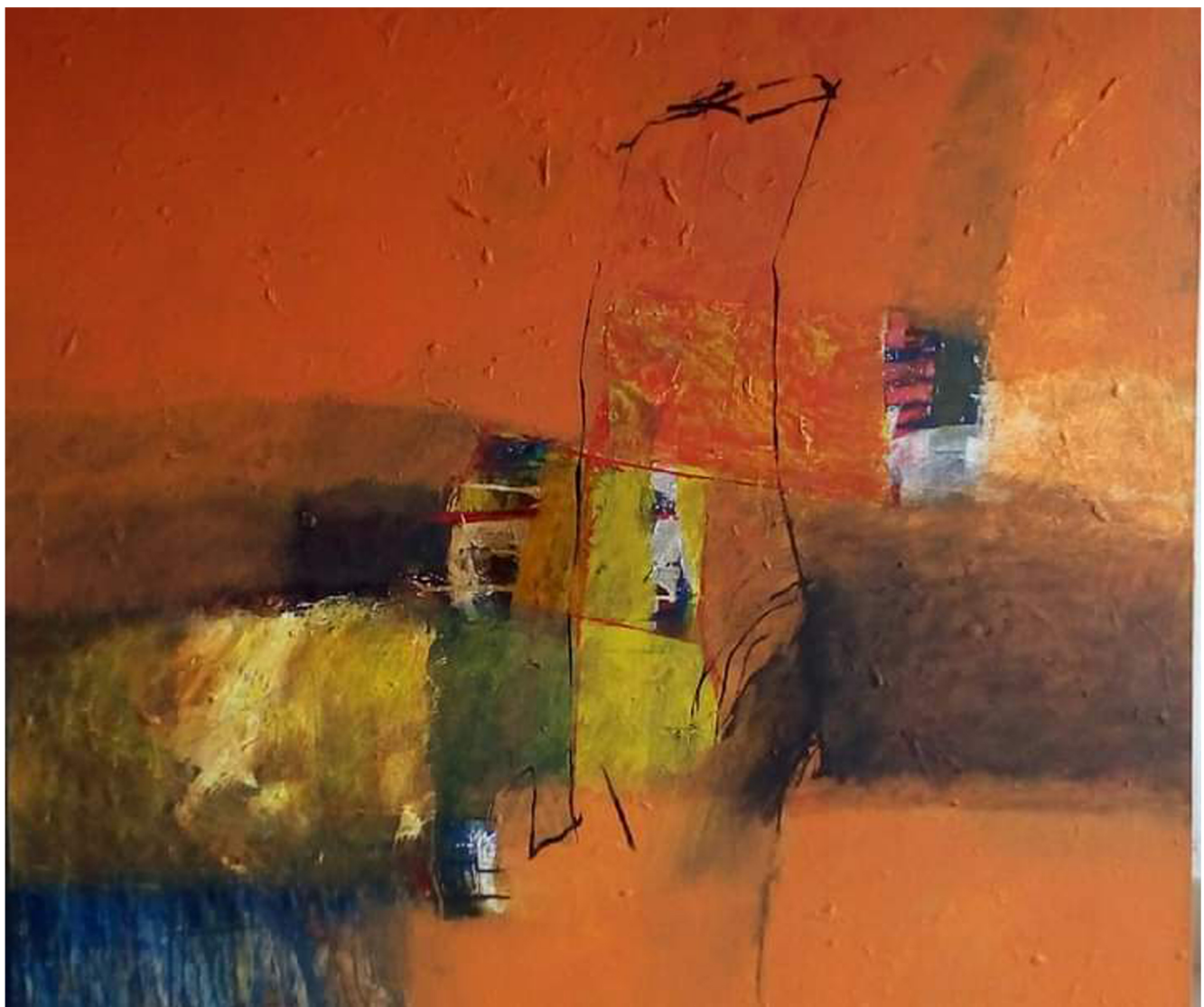
Land's Image / Imaji Tanah, 100 x 100 cm, acrylic on canvas, 2011