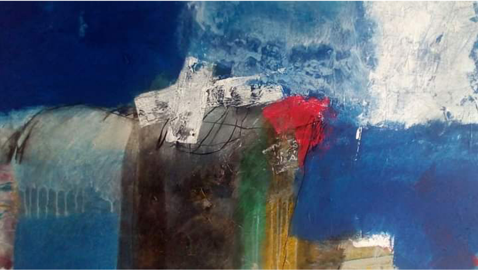
The Mystery of the Waves | Misteri Ombak, 120 x 80 cm, acrylic on canvas, 2011