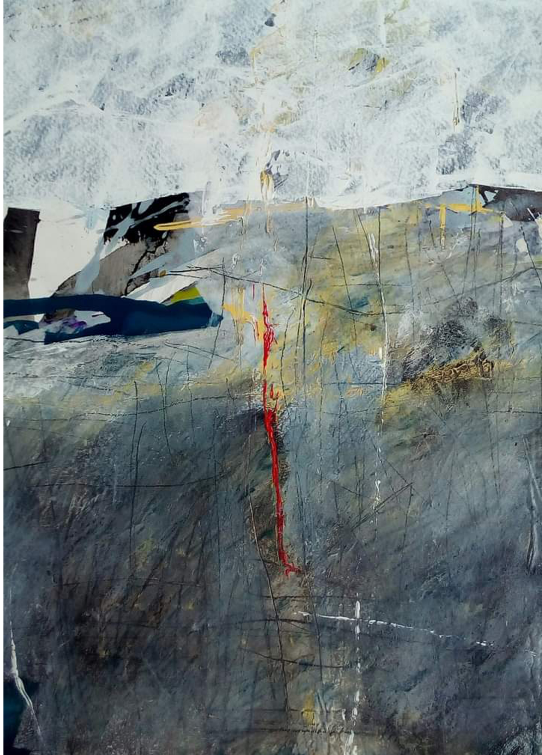
Landscape | Lanskap, 100 x 80 cm, acrylic on canvas, 2010