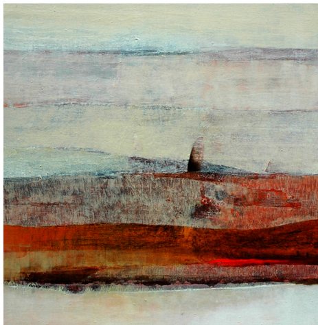
Coastline / Garis Pantai, 80x100 cm, acrylic on canvas, 2011

Dari dulu Wayan mencoba untuk memanfaatkan garis dan warna biomorfis, yakni garis-garis dan warna-warna hidup (dan menghidupkan) suatu garis dan warna yang dipresentasiakan dengan linier, spontan, dan membebaskan jejak emosi. Disinilah telah terjadi tramutasi energi antara dunia luar dan dunia dalam suatu kesadaran visi (yang merupakan gejala konseptual) dan sensibilitas (yang merupakan gejala mengungkapkan perasaan). Tranmutasi energi adalah bagian proses simbolisasi atau pembentukasn simbol-simbol. Inilah penggubahan gambaran yang kendati tidak sepenuhnya disadari oleh Wayan untuk pencarian nilai-nilai. Dalam hal ini sensibilitas mengalami aksi-reaksi dengan realitas yang menekan berkembaqng menjadi desakan emosi yang satar dengan keinginan-keinginan ”menyatakan kembali apa yang pernah dialami” dengan mengalami perubahan substansi.