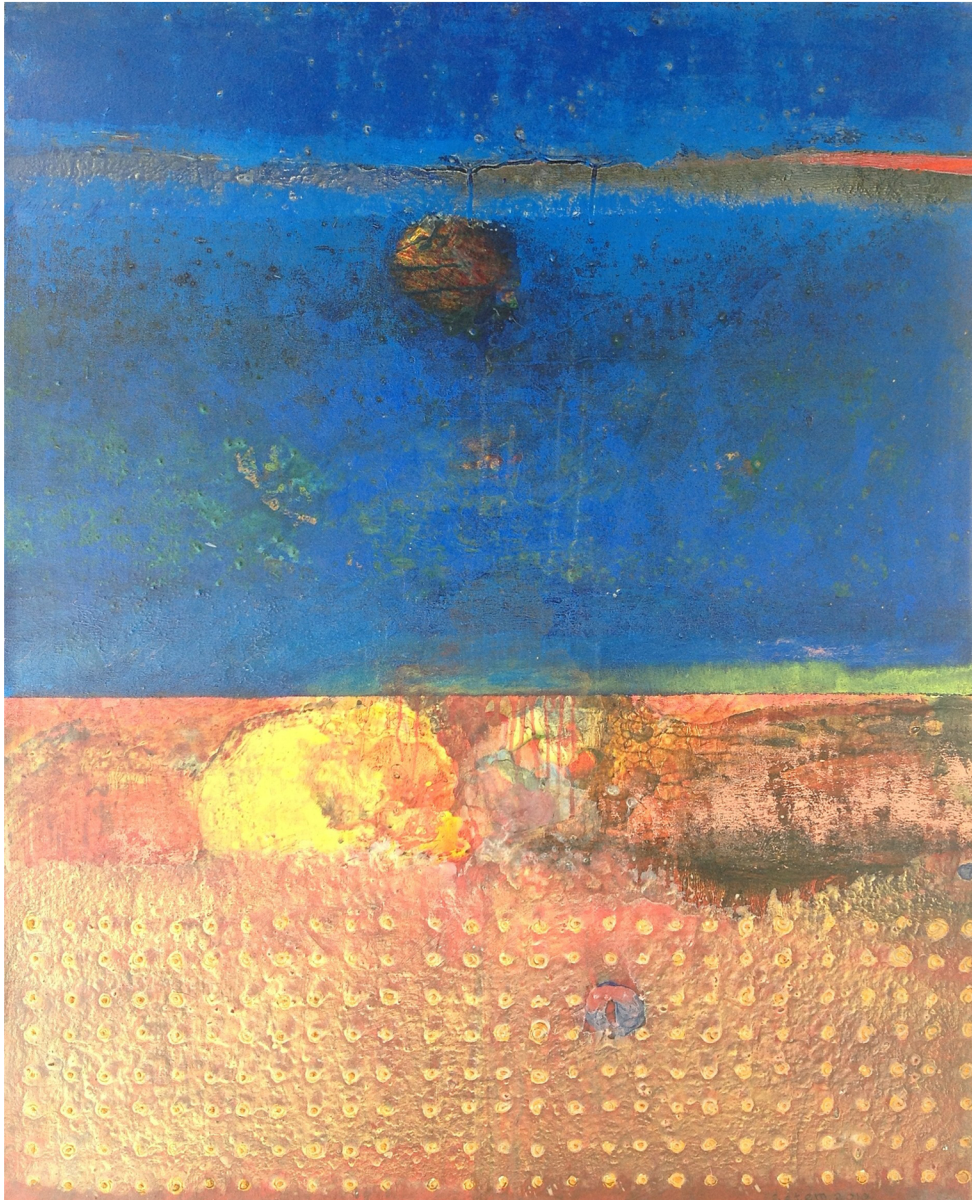
The Lingam by the Beach / Lingga di Pinggir Pantai, 140 x 140 cm, acrylic on canvas, 2010