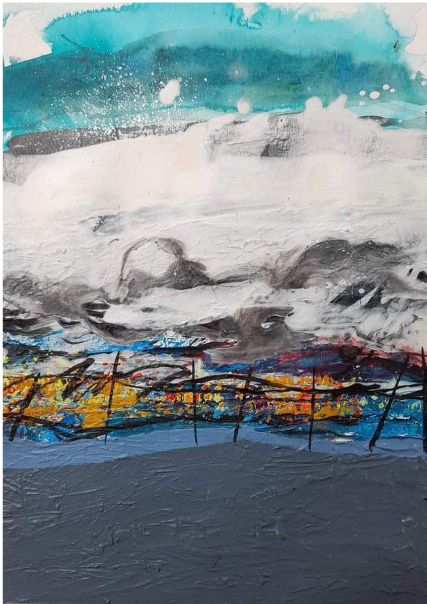
Waves Fence / Pagar Ombak, 100 x 80 cm, acrylic on canvas, 2010