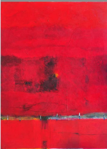
Red Space's Image / Imaji Ruang Merah, 100 x 80 cm, acrylic on canvas, 2010