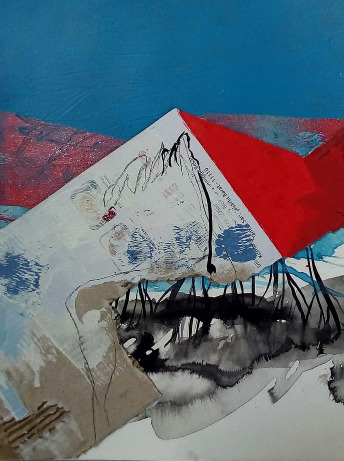
Mountain's Image | Imaji Gunung, 100 x 80 cm, acrylic on canvas, 2010