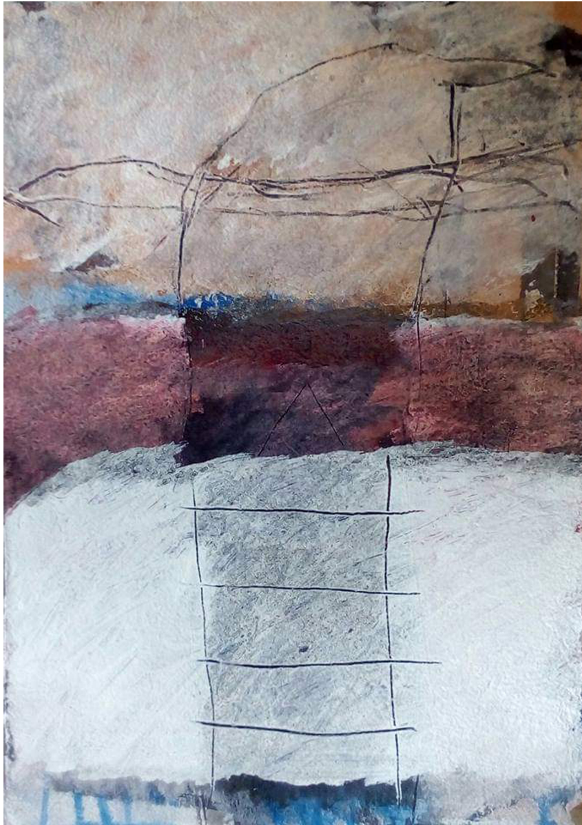
Ladder of Life / Tangga Kehidupan, 100 x 80 cm, acrylic on canvas, 2011