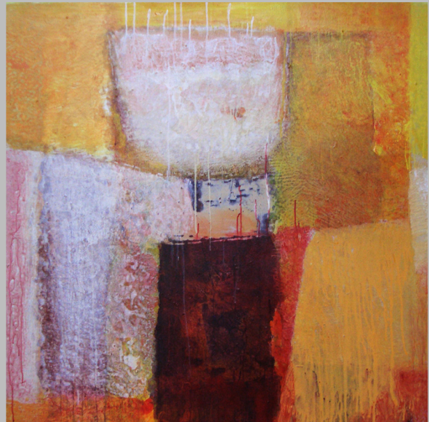
Yellow Hallway | Lorong Kuning, 200 x 60 cm (2 panel), acrylic on canvas, 2011