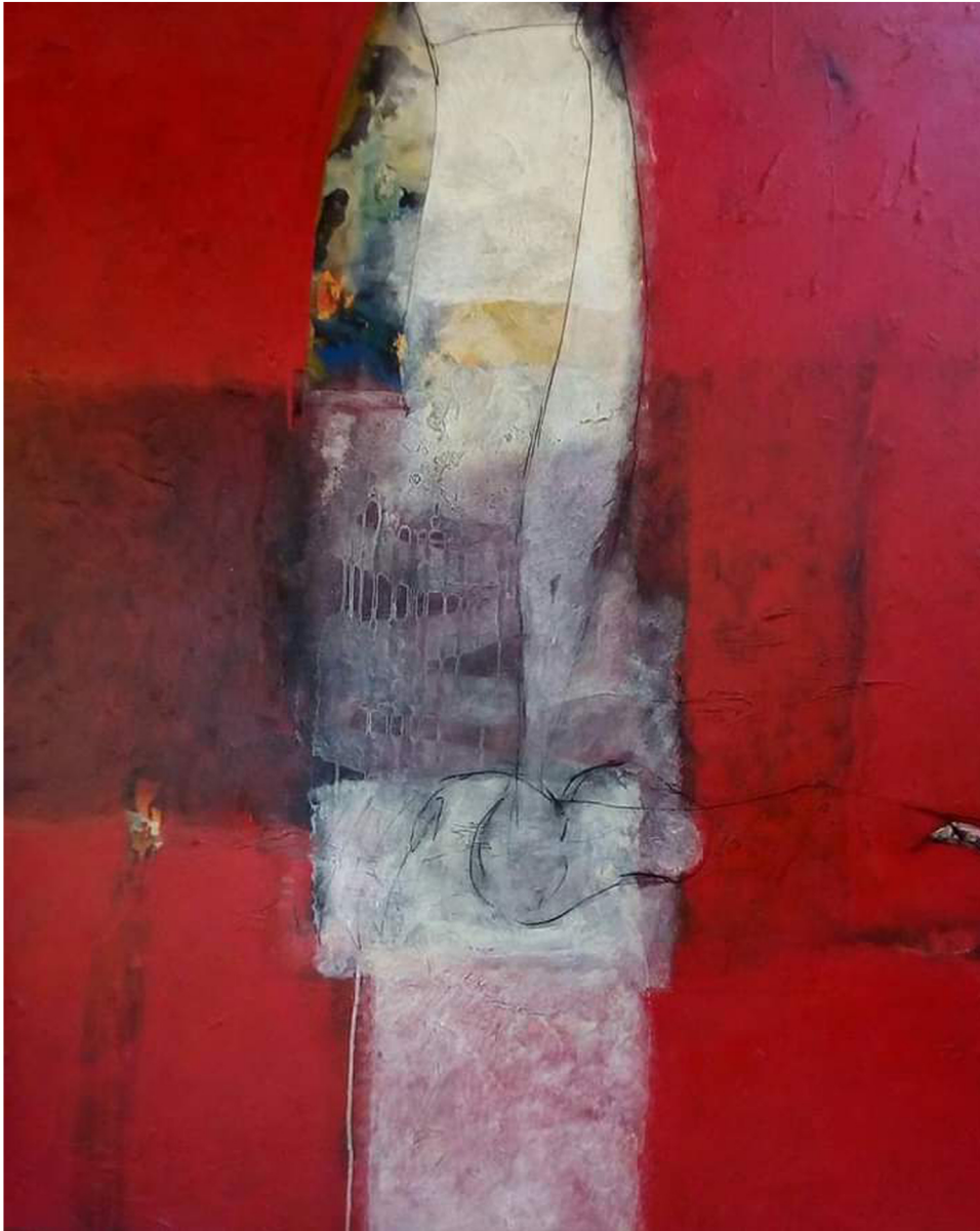
White Lingam on a Red Background / Lingga Putih Berlatar Merah, 100 x 80 cm, acrylic on canvas, 2011