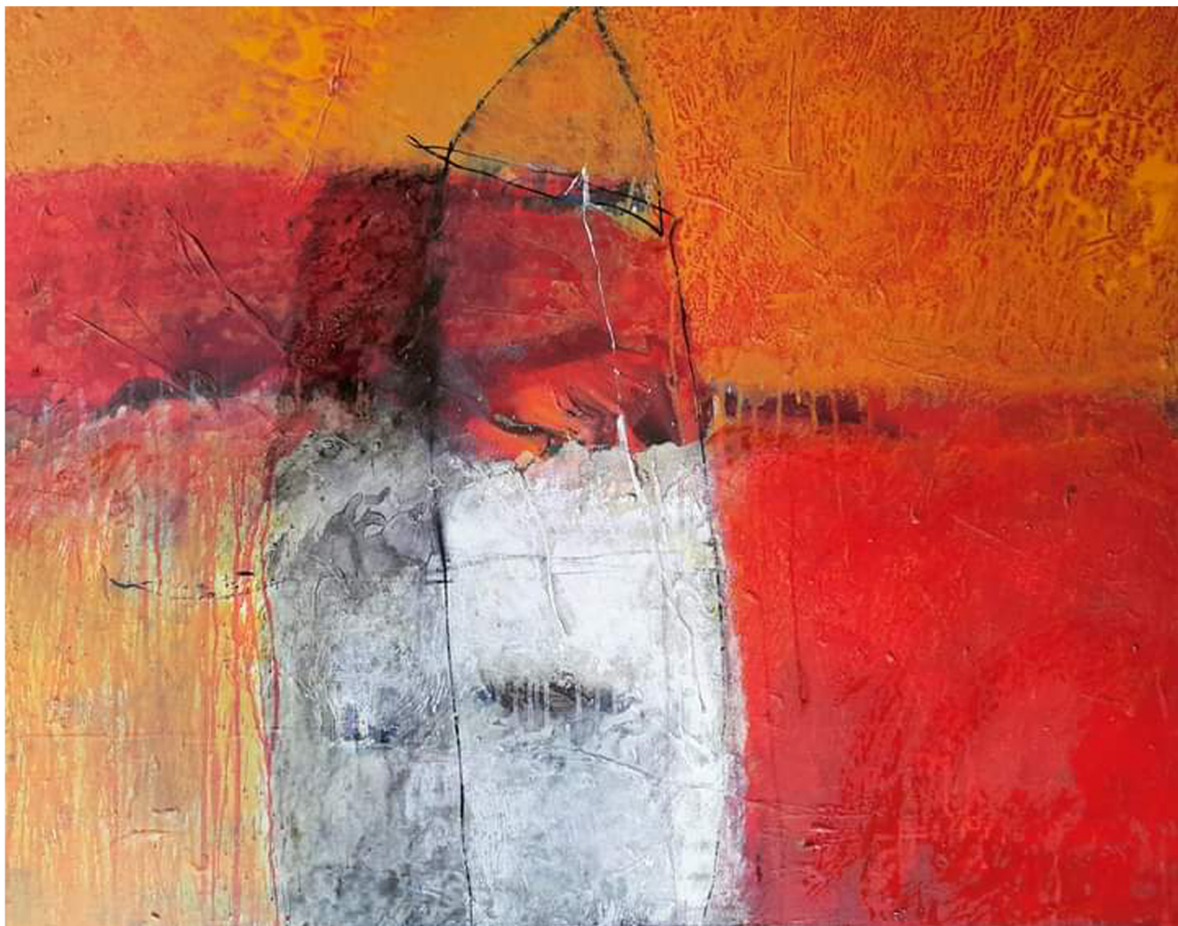
Monument's Footprint | Jejak Monumen, 110 x 100 cm, acrylic on canvas, 2010