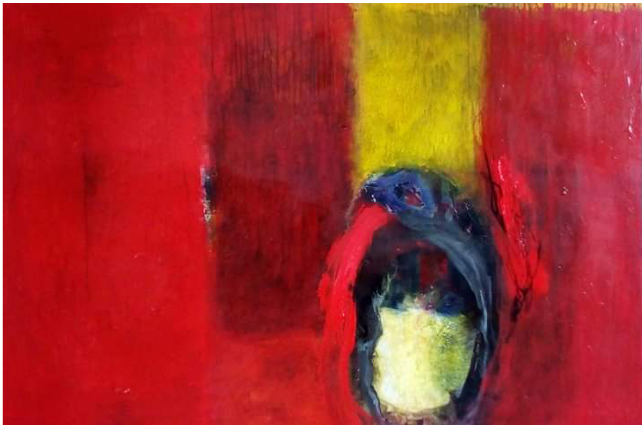
Composition / Komposisi, 100 x 80 cm, acrylic on canvas, 2011