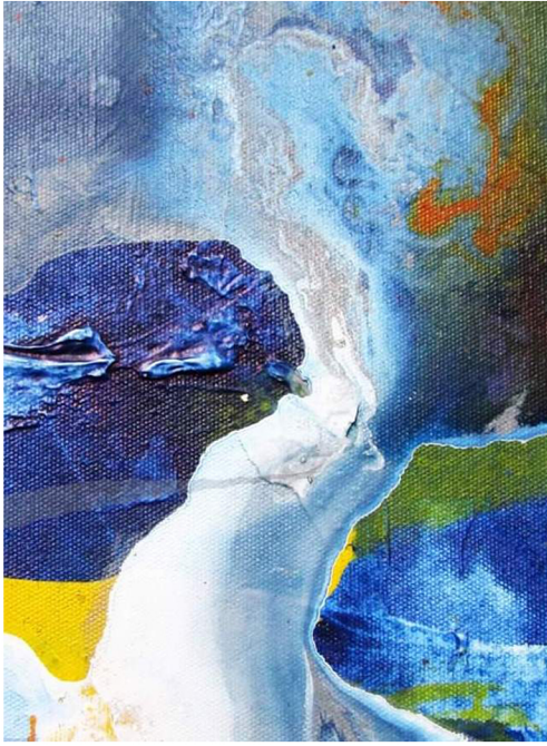
Water's Flow | Alir Air, 100 x 80 cm, acrylic on canvas, 2011

A painting that accentuates the sensitivity of spontaneity by relying on a sensitivity to irregular shapes. The lines and colors were made into his visual ideas. Lines and colors seemed to just pop up in line with his hands, thoughts, and feelings following the brush flow. An exploration in the painting process which is very mystical. This exploration is a kind of emotional expression without a clear design direction, taking turns following changes that occur spontaneously. At the beginning of making color blocks on the canvas area was not based on consideration of the result. All color blocks occur based on reflex motion. Sometimes unexpectedly the shed colors create the impression of effects and the possibility of further development. From there, you will find possibilities that can be developed according to his emotions. Sometimes the initial process continues on several areas of the canvas that have been prepared. The next process is to develop these possibilities. At this stage Wayan made more detailed preparations by responding again using suitable colors. This is where we intensively include considerations, decisions, personal images, memories, intuition and inner atmosphere when painting. Techniques are also richer: strokes, strokes, melts, building dynamic shapes, lines and planes. All elements are presented in a more dynamic and lively atmosphere.