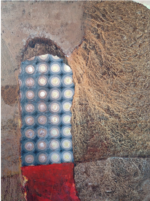
Lingga Batu | Lingga Batu, 100 x 80 cm, acrylic on canvas, 2010

In order to explore Wayan's works, we must try to open ourselves up with emotion or intellect to appreciate them. We cannot wait or for Wayan himself to explain what is being painted, of course we will not get an answer. "Wayan himself did not know what he wanted to convey when painting". Likewise, if we look at all, we will feel confused, unable to enter the world of Wayan's symbol. His work demands the importance of individual experiences and perceptions. We have to find within ourselves how the visual warnings in his work of colors, lines, fields are able to impress us. What is expressed through his work evokes our emotions by way of the arrangement and play of lines, colors and planes.