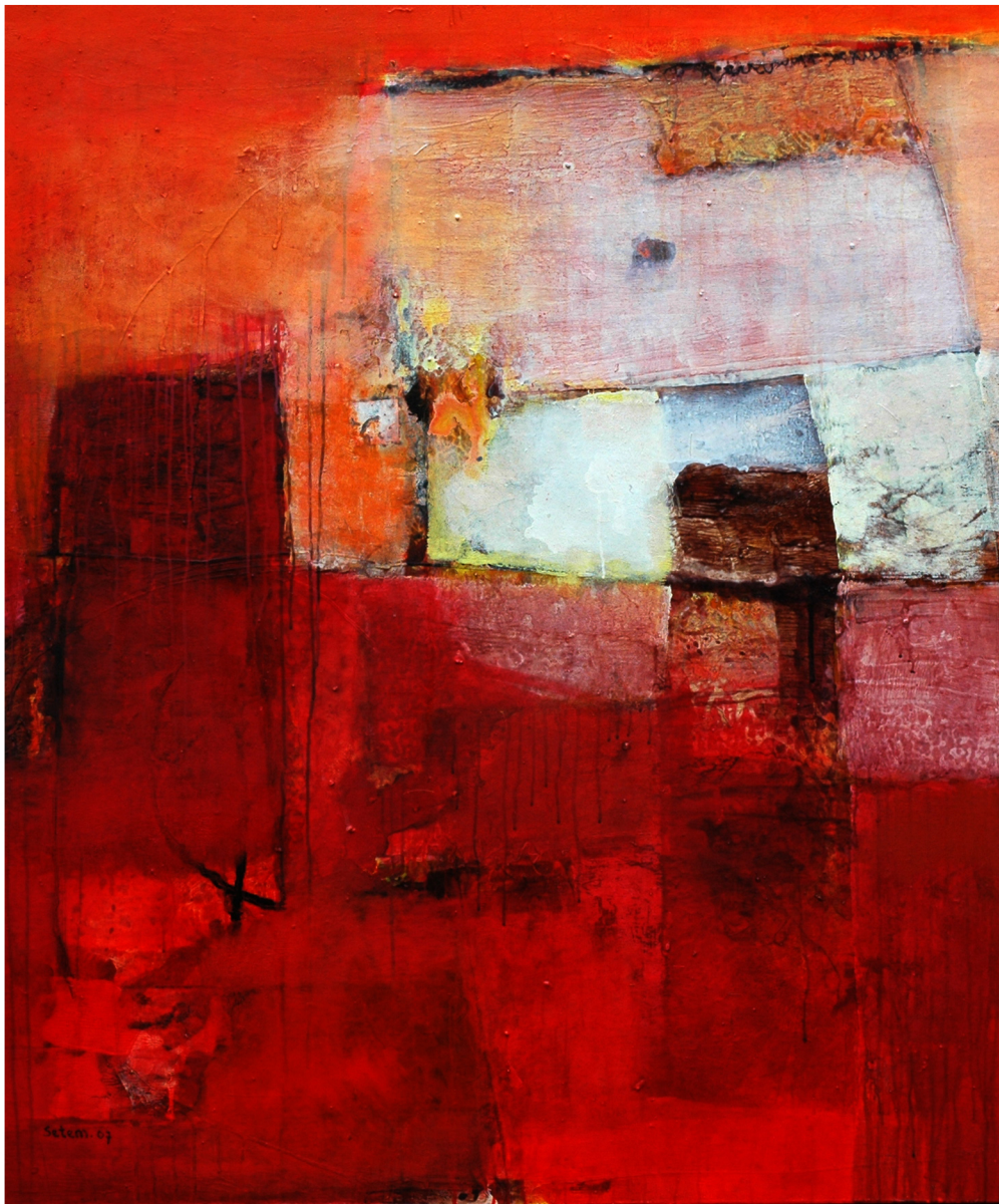
Temple's Artifact / Artefak Candi, 140 x 140 cm, acrylic on canvas, 2010