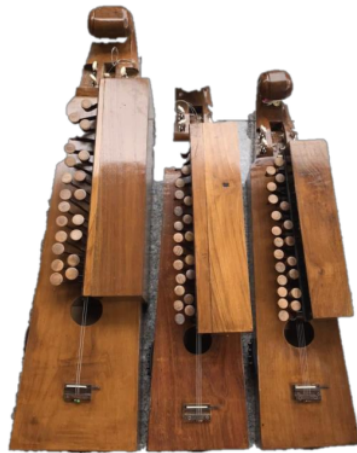
Differences in the shape of the Nolin instrument (low, medium, and high angkepan)