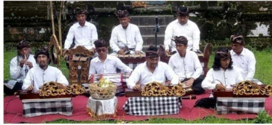
The mandolin is collaborated with Balinese gamelan instruments