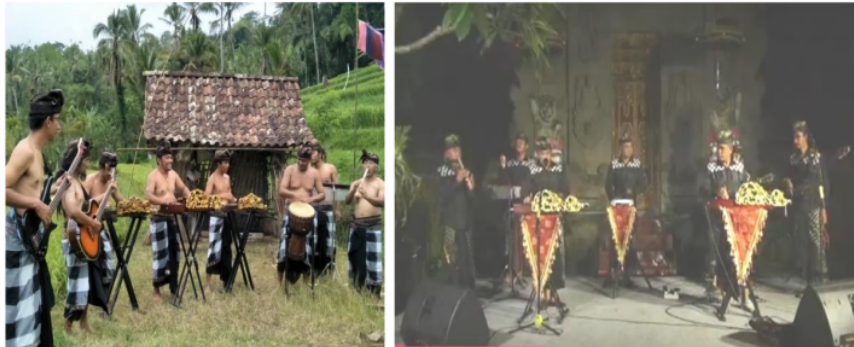
Collaborated mandolin with western musical instruments (Doc. Journalist)

A show sometimes does not always stand alone, in the sense that a show does not always consist of only one type of instrument. Mandolins can collaborate with other instruments, both of the same type and different instruments. Collaboration, in this case, can be interpreted as the addition of another form in art with the aim that the art can be more attractive to the audience without leaving the aesthetic value and meaning of the art itself. As has been done by the Mandolin Bungsil Gading Pupuan group, they are very creative in making breakthroughs to increase their attractiveness and increase their passion for art. Many innovations have been made to get the opportunity to put on a show. In various performances, Mandolin has collaborated with Guitar , Flute , Jimbe , and Ketipung instruments, as well as interesting vocal preparations. However, on different occasions, it has also collaborated with the gamelan instruments Semar Pagulingan , Kendang Krumpungan , Gong Pulu , and others. Sometimes Mandolin often collaborates with pop music such as accompanying bands and Balinese pop song singers. Even so, the ethics and aesthetics of playing Mandolin music are well maintained. This proves that the Mandolin can collaborate with several musical instruments, both traditional musical instruments, and other modern instruments.