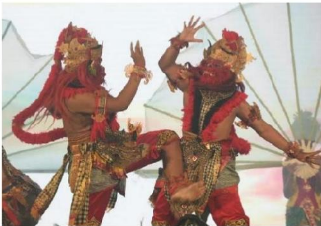
Figure 4: Subali and Sugriwa

Seventh , the teaching about human existence as servants of God (religious values). This is reflected in the final round of the Cupu Manik Astagina story that the three sons of Resi Gotama (Dewi Anjani, Subali and Sugriwa) did a meditation to beg for mercy, worship, worship God before they changed their physical appearance to normal.