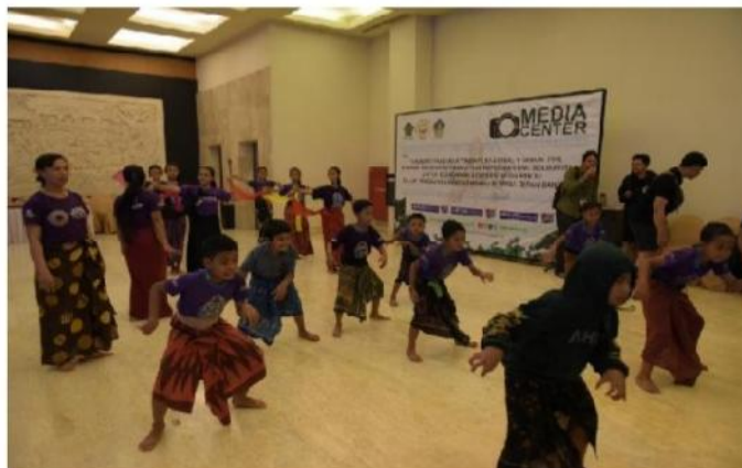
Figure 1: Train Millennial Generation to become an innovative Puppet Wong player

Children and adolescents in Bali love the Wayang Wong Innovative performance of Cupu Manik Astagina because the form of presentation seems to be in line with the character of children and young people today who are cheerful, dynamic, sporty, and enjoy things related to technology. An innovative Wayang Wong involving millennial generation includes a