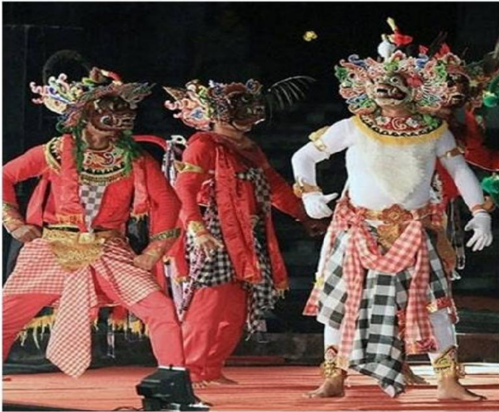
Figure 1. Traditional Balinese Wayang Wong Performing Arts

The Wayang Wong performance in Bali can be seen played by dancers who dance based on Wayang stories by using traditional Balinese dance clothes that are covered with an accompaniment of gamelan music. The musical accompaniment is a determinant of the quality of the performing arts (Rai et.al., 2019). The sound of the gamelan is intended to build and maintain the identity and quality of drama in the aesthetics of the Wayang Wong performance. Traditionally, Wayang Wong in Bali is staged by adult dancers with the hearing only covering parents.