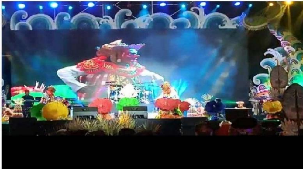
Figure 2. The Art of Wayang Wong Millennial

The Wayang Wong Millennial has an innovative form of Wayang Wong performing arts. The form of the Wayang Wong Millennial performance is classified as a colossal Balinese Wayang Wong performance art by involving children as Wayang Wong dancers. The components of the Wayang Wong Millennial performance consisting of choreography, characters, Wayang story dialogue, dance movements and musical accompaniment involving children from millennial groups have invited new appreciation for Wayang Wong which is known for its ancient performing arts and performing arts that are in decline. New appreciation comes along with different nuances of the performing arts and collaborative relationships (Pradana, 2017). The collaborative relationship between artists, researchers and organisers have had an impact on the existential of Wayang Wong Millennial that looks stunning as innovative performing arts.