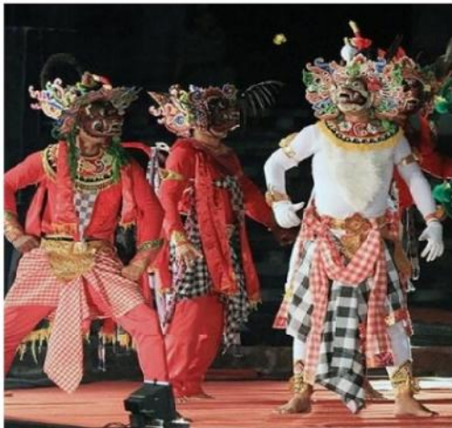
Figure 2: Innovative Wayang Wong

nuding (pointing at something), ulap-ulap (glaring), nadab gelung (fixing the crown), and sesaputan (tidying clothes). Examples of dance movements can be seen in Figure 2.