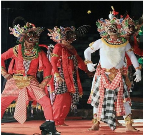
Figure 2: Innovative Wayang Wong

nuding (pointing at something), ulap-ulap (glaring), nadab gelung (fixing the crown), and saputan (tidying clothes). Examples of dance movements can be seen in Figure 2.