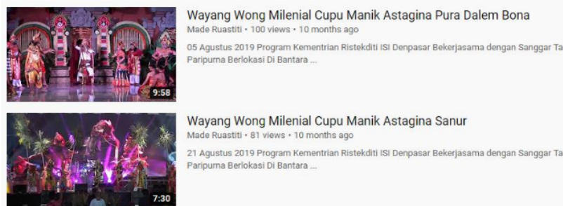
Figure 1: Wayang Wong

Tabanan and Buleleng; (b) Wayang Wong can be used as a vehicle for talents and character building of the next generation especially millennial generation; (c) the need to conserve and progress of Wayang Wong according to digital trends in revolution industrial (4.0). All data were collected through document study, observation of Wayang Wong , and in-depth interviews with informants from puppet art lovers, puppet art observers and puppet art actors in Denpasar and Gianyar as shown in the picture below.