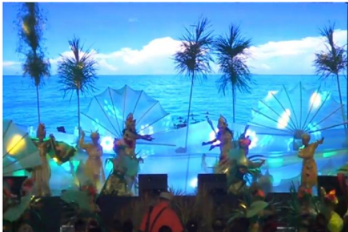
Figure 2 : Wayang Wong 'Cupu Manik Astagina' at Sanur Art and Cultural Festival

It seemed that youth welcomed the Balinese innovative Wayang Wong arts model. The general public and parents of the new artists appreciated the new arts model in the innovative Balinese Wayang Wong . The audience from various circles also positively welcomed the Wayang Wong 's 'Cupu Manik Astagina' potential being developed as a tourist attraction in Bali (Ruastiti, 2020a; Ruastiti, 2020b).