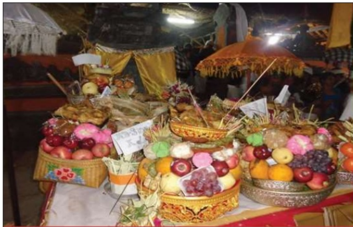
Figure 4. Banten pajegan , offerings for the Goddess of Fertility.

Banten(s) containing fruits are distributed to all Rejang Tegak dancers. The tradition is a symbol of the blessing of the Goddess of Fertility. Based on this belief, the dancers are very happy if they get fruit from the offerings. They assume that if they get sweet fruit, the dancers get special attention. People's belief in religious matters of the nature is still very strongly attached. In addition to these expressions, their belief in the existence of supernatural powers, which are still influential in their living environment, is shown by the behavior of the people who are very serious in preparing everything related to the Karya Gede ceremony. The banten(s) are prepared by krama subak as an offering in front of the place of worship of the Fertility Goddess, also called Ratu Manik Ceraki . The offering ritual is led by the leader of Puseh Desa Temple in front of the place of worship of Ratu Manik Ceraki .