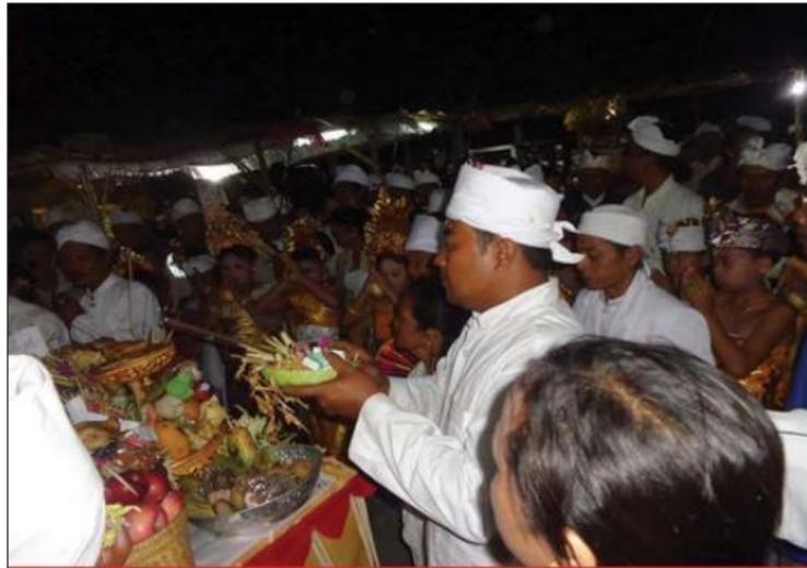
Figure 5. The ceremony before Rejang Tegak Dance is performed.

As a sacred dance, Rejang Tegak Dance, presented at Karya Gede in Puseh Desa Temple, Busungbiu Village, is presented with certain criteria. Eliade (1958) revealed that to understand activities related to sacredness, there are two important things which consist of sacred and profane. Sacred is related to things that are sacred, sacred, while profane is the opposite (Pradana et al. 2016). Related to this, Rejang Tegak Dance in Busungbiu Village has its own purification process which makes the dance classified into a sacred dance group. At the beginning of the dance, the dancers always go through the process of purification by performing the prayascita ceremony (purification).