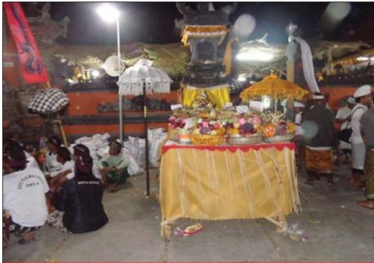
Figure 7. The place to worship Ratu Manik Ceraki (Goddess of Fertility).

Even though the dance is very simple, the people of Busungbiu Village still maintain and preserve this dance. They still maintain and always perform this Rejang Tegak Dance for the presentation of the Karya Gede Ceremony at Puseh Desa Temple, Busungbiu Village. The process of performing the Rejang Tegak Dance is preceded by a ritual of requesting permission from the Goddess of Fertility led by the leader of the ceremony in Hinduism (Figure 8).