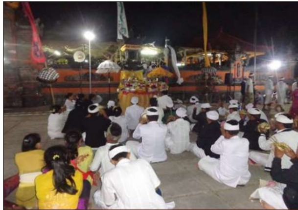
Figure 3. Palinggih Ratu Manik Ceraki at Puseh Temple of the village (Photo: Ruastiti 2018).

This phenomenon is interesting to review since Rejang Dance is generally performed by female dancers by both children and young women in Bali. It is different with Rejang Tegak Dance in Busungbiu Village which is performed by the old men from the village's native population, amounting to 66 heads of families. In addition to being only performed by the native villagers, this event is only carried out every five years so that this moment is considered very special for the people of Busungbiu Village.