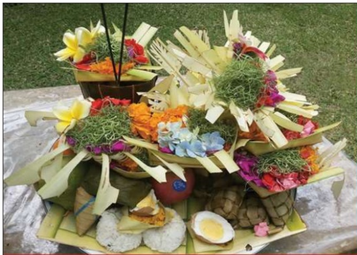
Figure 9. Banten Pejati is presented before the Rejang Tegak Dance performance begins.

In addition to offering banten pejati in the Karya Gede ceremony at Puseh Desa Temple in Busungbiu Village, the environment of the ceremony is also decorated with penjor (ornamental coconut) which is installed in front of the temple gate or on the road to the temple. Meanwhile, from a distance there is a faint sound of singing and the sounds of the gamelan . The atmosphere of excitement created by the people of Busungbiu Village implies that the Puseh Desa Temple is holding the Karya Gede ritual ceremony. The general public know that the sign of the festivities in the religious atmosphere indicates that the Karya Gede ritual ceremony was being held at that that site. Crowd of people praying in the midst of the festive decoration of coconut leaves, people singing hymns, dancing, playing musical instrument and others are signs of the Karya Gede ritual ceremony which is interpreted by the local people as an offering ceremony, an expression of gratitude to please the Gods they worship. The concerns that the people will get into trouble with their agricultural land are gone and the optimism are coming. Moreover, through the staging of the Rejang Tegak Dance at the ceremony, they believed that it would provide welfare for the people. It is an obligation and tradition of their ancestors who are believed to have provided many positive benefits to their lives for generations.