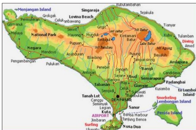
Figure 1. Street directory map of Bali. (From http://www.google.co.id/search?q=peta+bali ). Accessed on 12 January 2018.

Bali Island consists of 9 regencies and each regency consists of several villages led by a village head. Busungbiu Village is a part of Buleleng Regency which is headed by a Regent. Buleleng Regency can be reached 81 km from Denpasar City. From Denpasar City, Buleleng Regency can be reached via the Denpasar-Singaraja asphalt road. By riding a motorcycle/driving a car, Buleleng Regency, whose capital city is Singaraja, can be reached from the north through the Mengwi or Pupuan intersections. Buleleng Regency is located in the east of Jembrana Regency, in the North of Badung Regency, in the West of Karangasem Regency, and in the South of the Bali Sea. This location is shown in Figure 1.