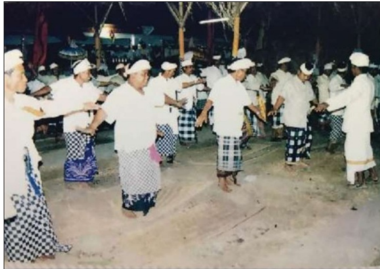
Figure 8. Rejang Tegak Dance in Busungbiu Village, Buleleng, Bali.