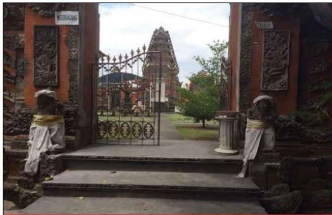
Figure 6. Puseh Desa Temple, Busungbiu: The location/place where Rejang Tegak Dance is performed.

Rejang Tegak Dance is performed in the jaba tengah (central courtyard) of the Puseh Desa Temple at Busungbiu Village. Puseh Desa Temple is a sacred temple by the local people. Not everyone can enter the area. The people of Busungbiu Village mention that the entrance to Puseh Desa Temple is only opened when there are certain religious celebration ceremonies or on special days if there are society members who wish to offer the offerings at the temple, for example at Purnama and Tilem celebrations. At that time, they will contact the Jero Mangku of Puseh Desa Temple to lead the prayer in front of the place to worship Ratu Manik Ceraki as Goddess of Fertility.