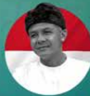
Ganjar Pranowo, S.H., M.I.P. Governor of Central Java