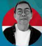
FX Harsono Artist, Indonesia