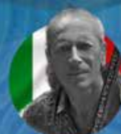
Anello Capuano Composer, Italy