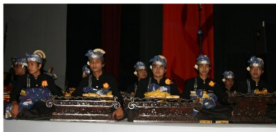
Figure 2. Presenting selonding in gamelan concert

The instrument's function development from its original function as a conventional instrument towards multi-function, complex melodic melodies, dynamics, and varied song structures is certainly due to development of the composer's aesthetic value demands and also the aesthetic demands and demands of its supporters, in the dialectics is adapted to the development of values and times.