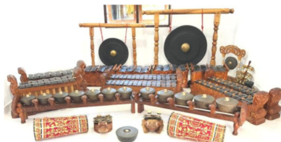
Figure 4. Barungan gamelan 'Pesel'

It is no exaggeration to say, that the barungan pesel emergence seems to be able to revive the barrel system , patet system , and the anchors that we already have. Barungan pesel can also prove that Balinese gamelan has polyphonic characteristics, which according to Western experts are commonly classified into polyrhythmic music with a wealth of expression, dynamics, and tempo playing. It is an advantage and uniqueness that is owned by gamelan pesel , grouped into the Balinese gamelan 'new group' which still originates from itself.