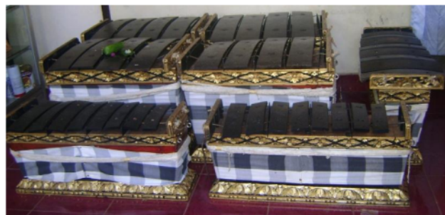
Figure 1. Selonding commodification, physical form, and instrumentation

Gamelan Selonding is one of the Balinese gamelan which has quite a lot of enthusiasts. In the performing arts arena, Bali Selonding is not a 'new thing' anymore. It is even often a concern for art activists. Empowerment occurs in the gamelan selonding is more triggered by the artist's creativity spirit. In the realm of social practices such as musical activities cannot be separated from various interests with specific goals.