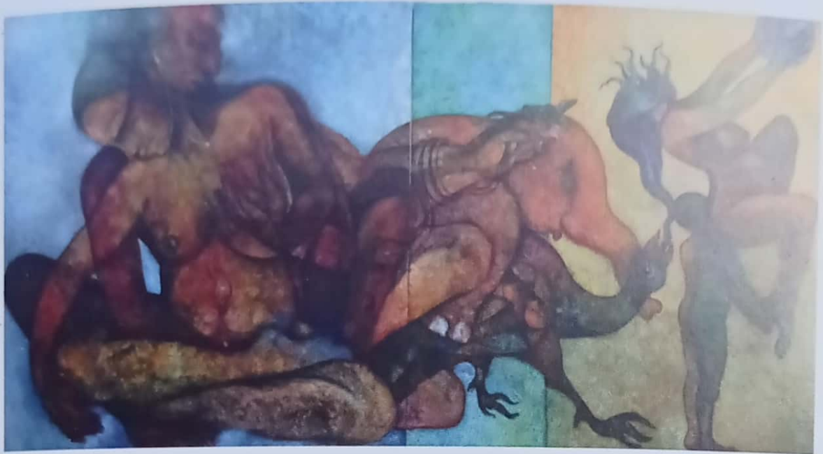
Jeganathan Ramachandram The Art of Love Acrylic on Canvas 244cm x 122cm 2012