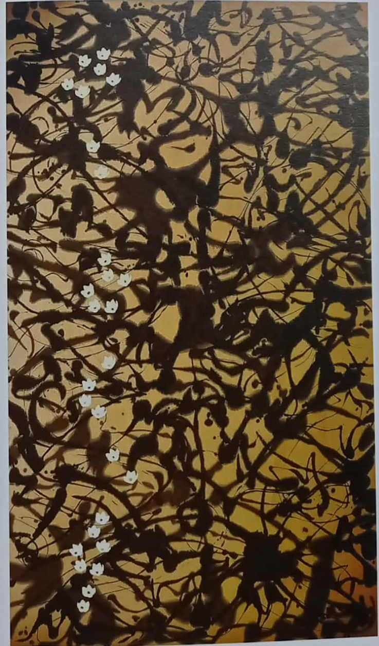
LAST NINE YEARS 01 | 180x300cm | Ink and acrylic on canvas | 2014