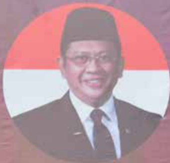
H. Bambang Soesatyo, S.E., M.B.A.

Chairman of the People's Consultative Assembly (Majelis Permusyawaratan Rakyat) of the Indonesian Republic (Majelis Permusyawaratan Rakyat Republik Indonesia)