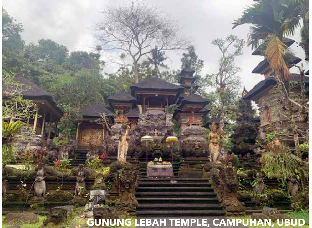
GUNUNG LEBAH TEMPLE, CAMPUHAN, UBUD