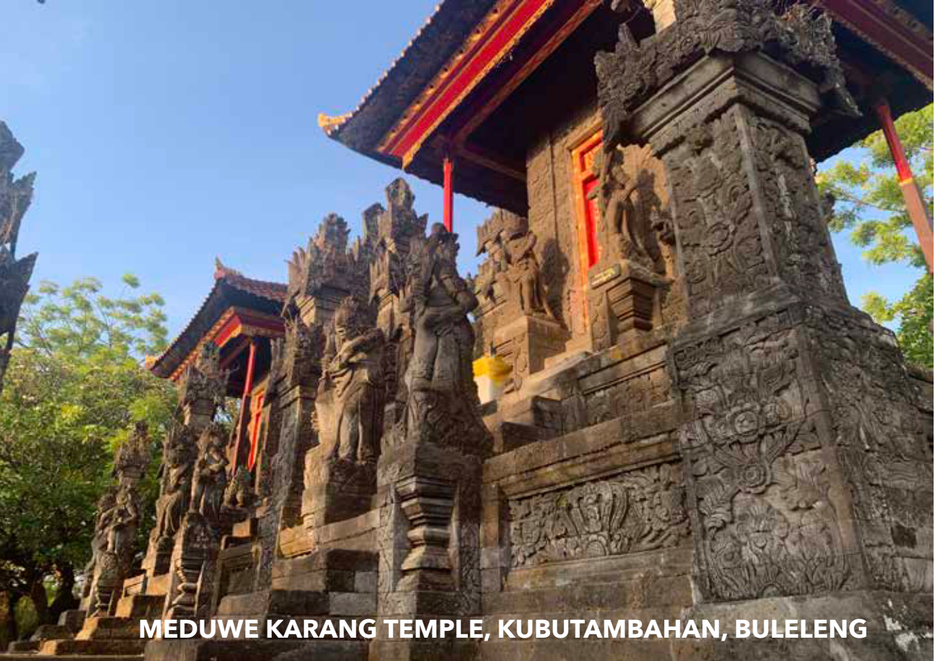
MEDUWE KARANG TEMPLE, KUBUTAMBAHAN, BULELENG