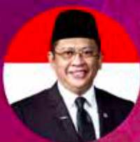
H. Bambang Soesatyo, S.E., M.B.A.

Chairman of the People's Consultative Assembly of Indonesian Republic (Majelis Permusyawaratan Rakyat Republik Indonesia)