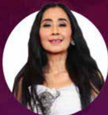
Ayu Laksmi (actress and musician)