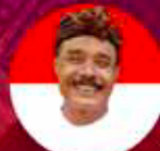
A.A. Gde Rai Agung Rai Museum of Arts, Bali Indonesia