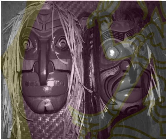
Picture 11. The Mask of Mask