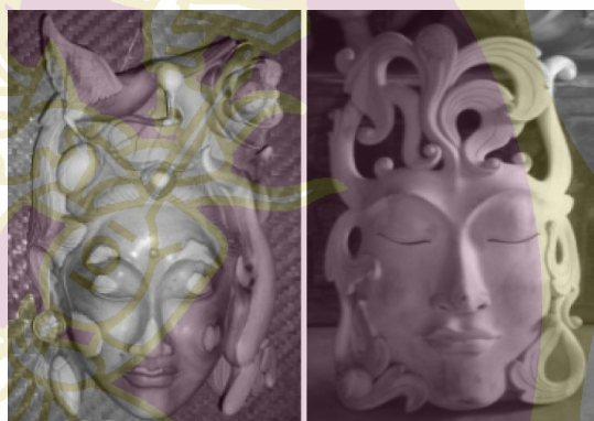
Picture 8. The Bawang Kesuna Masks

The content is sacrificed and the past, as one of the inspirations, is appreciated. Then, one model 'the phenomenon of aesthetics', which, in this case, does not refer to beauty and harmony but to falsity and enrichment characterized by the attempts made to do something extraordinarily, extravagantly and glamorously. Falsity is promised as a model of aesthetics and is unnatural in nature. The nature, human beings and animals are often used as the objects but they are extremely deformed; they are made thinner, more slender or tall.