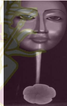
Picture 6. Bidadari Mask

real objects. The black used on the eyebrows, for example, does not symbolize anything but the color of eyebrows itself. However, the red on the mask's mouth, apart from representing the real color of the mouth itself, also symbolizes sexuality which can tempt those who enjoy it. As a whole, the 'bidadari' mask, apart from symbolizing something, also has a particular role to represent modern art work giving priority to aesthetic, ethic and logical values referring to Hinduism.