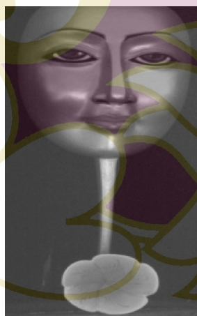
Picture 10. Dewi Aphrodite Masks