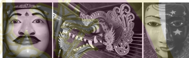
Picture 1. Traditional mask (Dalem); Picture 2. Naga mask with high intensity color; and Picture 3. Modern mask, in which difference in unity can be seen

3) Emphasis; the central part of the mask; the part on which the view is focused and therefore it is referred to as Central of Inters. This can be created by using a striking color or by dividing the lines which go in different directions, and by using a shade with high intensity. In any traditional mask art, it is not absolutely needed; however, in modern masks emphasis is absolutely needed to give other aesthetic values as refusal to tradition.