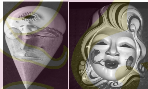
Picture 4. 'Garam and Merica' Mask; Ornamented with Points; Picture 5. the Mask with the Lines Which Curve Downwards.

As an illustration, a) vertical and horizontal areas give impressions of tranquility, being static, being stable and movement; b) round area gives impressions of being occasionally stable, occasional movement; c) triangle gives impression of being both stable and dynamic; and d) wavy area (sunken and curvy) gives impression of being rhythmic and movement. The form of area in any carving work can be negative and positive. The area is stated to be negative if it is made of three or four lines and if it is assumed to have holes or penetrations, meaning that the lines made function as the contour. The penetration made on the mask eyes concretely illustrates this. The area is stated to be positive if it is horizontally made of many lines which are connected with each other. What is referred to as keras , the area which is made of woven bamboo, concretely illustrates this. In the modern art work created by Anom, the area is used to the characteristics and identity of the mask. In addition, the area is also used to emphasize the expressive values, the movement values, the rhythmic values and the directional values which are formed through the negative area. The negative area is also used to give aesthetic space of movement so that the user's agility can be revealed depending on what he wishes. Such an area can also function to ease the user to communicate (to voice) and see his surrounding when the mask is being used.