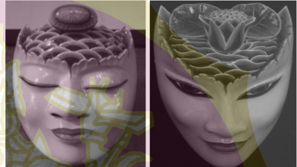
Picture 9. The Ibu Pertiwi Masks

processed creatively to combine the two styles; as a result, the symbolic values of two countries are reflected with their realistic and decorative characteristics representing the modern art work.